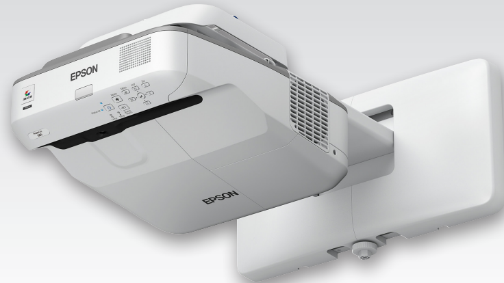
Shown with optional wall mount (sold separately)